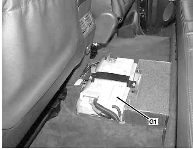
G1 On-board electrical system battery