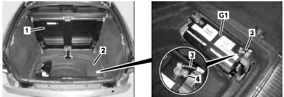
Fig. 1 Primary battery ground removal